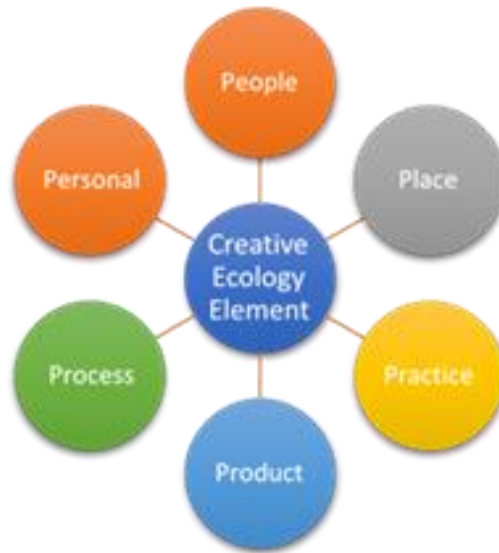
Figure 2: Creative ecology element

producer and a few organisations in Terengganu. However, the analysis revealed that, it raised an unanswered question about the effectiveness of previous co-practice efforts within brassware craft industry. Lack of effective communication and lack of knowledge, afraid of unknown are among the issues hinder brassware sector as well as its community to re-grow.