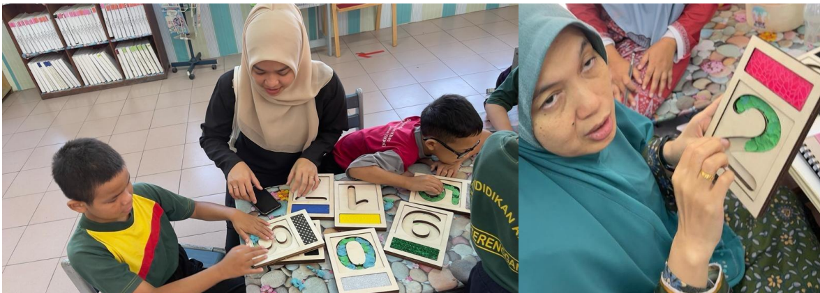
Figure 2: Pre-Test Learning Toy (wooden number for blind kids)

A wide range of print images that contain information presented in visual formats can be represented using tactile graphics. diagram, illustration, graphic, figure, and drawing, among others. These graphics may be created using a number of techniques and materials. They provide a tactile representation of diagrams and information offered in print to go along with textual information. Innovation on fundamental instructive channel toward teaching kids letterforms (typography), vocabularies also the exterior shapes irrespective of the size especially kid-playschool to standard eight [23] and the characteristic on tactile graphics or 3D model should be small and easy to handle and fit on the table or any place. The component should fit together so that they will not be moved about when explored tactually [24]. By using the Guidelines and Standard for Tactile Graphic, design tactile graphic for early grade it's important that material include tactile graphic, match picture to sound, letter, word or sentences (phonics and ask the students to circle all of the picture), draw a shape configuration to identify words, "read" the story or "word" and perform handwriting tasks. Best educational practice include alternate activities that support the students in acquiring the skills of literacy, numeracy and graphicacy [25].