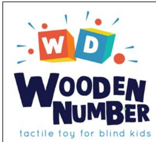
Figure 6: Logo Brand for Product

Initially, 10 sketches of various logos were made, and the best one was chosen to be used as a logo for tactile toys for blind kids. For this logo, the researchers employed a cube with the letter "W" and "D" as symbols, and the text is Wooden Number. The logo is on the container to promote the market of the product and to raise number of the tactile sensory toys for blind kids in Malaysia. On the logo, the letters "Wooden Number," "W," and "D" are all written in the Autumn Voyage Regular typeface. Additionally, researchers employ logo forms like the round and diamond to represent texture. The logo's color uses vibrant, contrasting hues to grab the public's attention. Blue-black is the color used on the text "Wooden Number" to provide contrast for the reader and enhance the text's legibility.