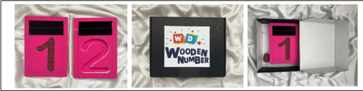
Figure 4: Mock-up.

The researcher created a sturdy mock-up for tactile sensory toy for blind kids using colour foam board, plasticine, and boxes as containers after determining the optimal size for the toy. Before a product composed of high-quality materials is produced, tactile sensory toys are demonstrated using mock-up, which are creative renderings of a design or product that illustrate the toys in use.