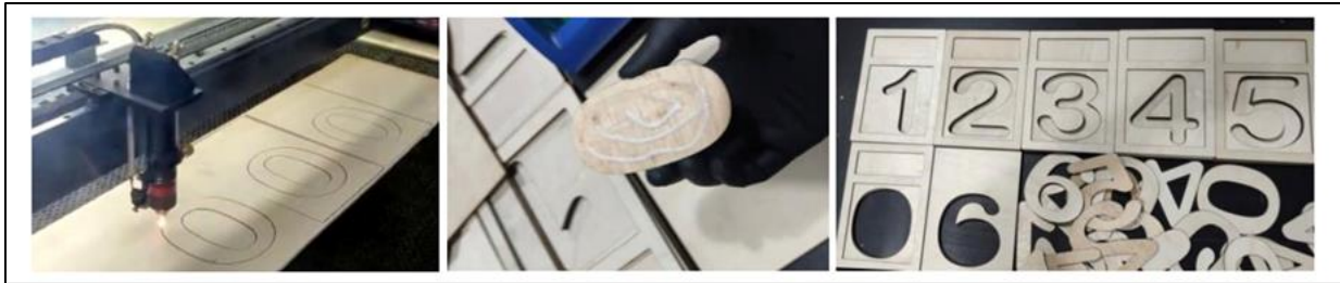
Figure 5: Process of Cutting Using Laser Cutting Machine and Carpenter Glue.

The researcher created a sturdy mock-up for tactile sensory toy for blind kids using colour foam board, plasticine, and boxes as containers after determining the optimal size for the toy. Before a product composed of high-quality materials is produced, tactile sensory toys are demonstrated using mock-up, which are creative renderings of a design or product that illustrate the toys in use.