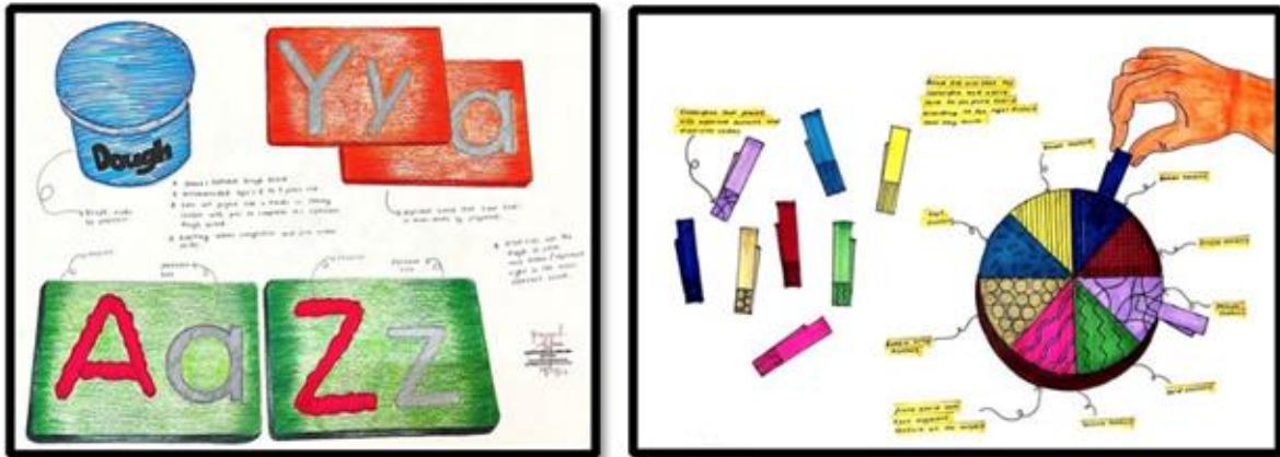
Figure 3: Sketches Idea

The main purpose of going to the special education school for blind children that is located in Kuala Terengganu (Sekolah Kebangsaan Pendidikan Khas) is to test Wooden Numbers for Blind Kids and get input from the school's teachers and blind students. The teachers and blind children have suggested that braille components be added to Wooden Numbers to make it quicker and simpler to identify each number. In addition, it is believed from the comments that there are other choices and materials besides clay that will aid in their participation in educational and game-based activities, particularly kinetic sand, which will help them develop their hand and sensory skills and it can use for mild and fully blind students. Overall, Wooden Numbers was greatly influenced by the instructors' and students' input so that the design could be improved to make it more effective for blind children to learn and play at the same time using Wooden Numbers.