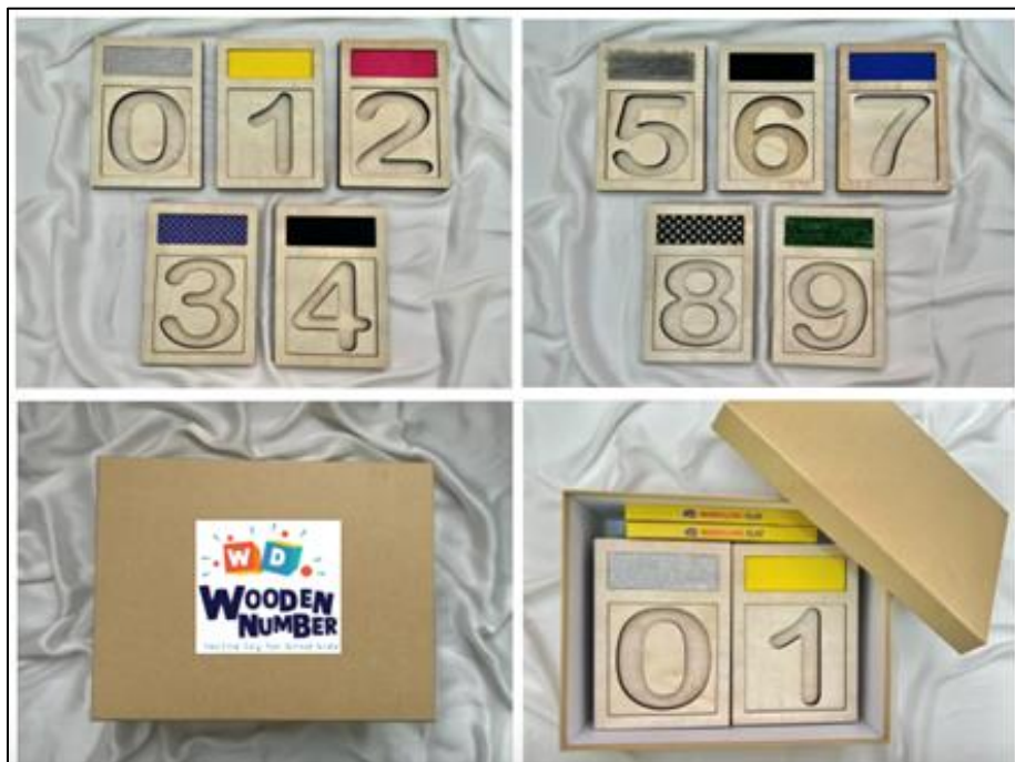
Figure 7: Final Product for Tactile Learning Toy for Blind Kids.

Initially, 10 sketches of various logos were made, and the best one was chosen to be used as a logo for tactile toys for blind kids. For this logo, the researchers employed a cube with the letter "W" and "D" as symbols, and the text is Wooden Number. The logo is on the container to promote the market of the product and to raise number of the tactile sensory toys for blind kids in Malaysia. On the logo, the letters "Wooden Number," "W," and "D" are all written in the Autumn Voyage Regular typeface. Additionally, researchers employ logo forms like the round and diamond to represent texture. The logo's color uses vibrant, contrasting hues to grab the public's attention. Blue-black is the color used on the text "Wooden Number" to provide contrast for the reader and enhance the text's legibility.